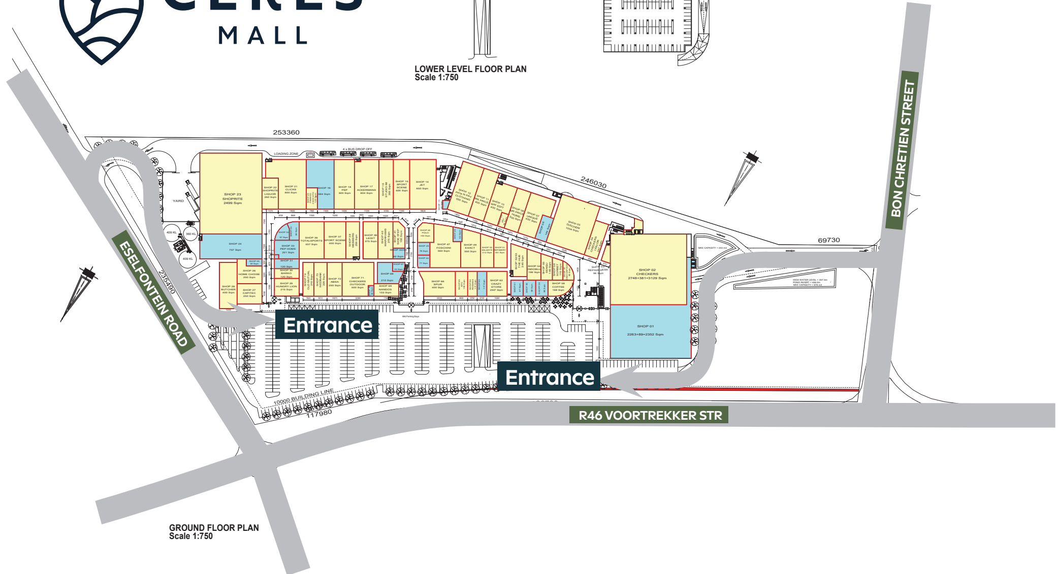
GROUND FLOOR PLAN Scale 1:750